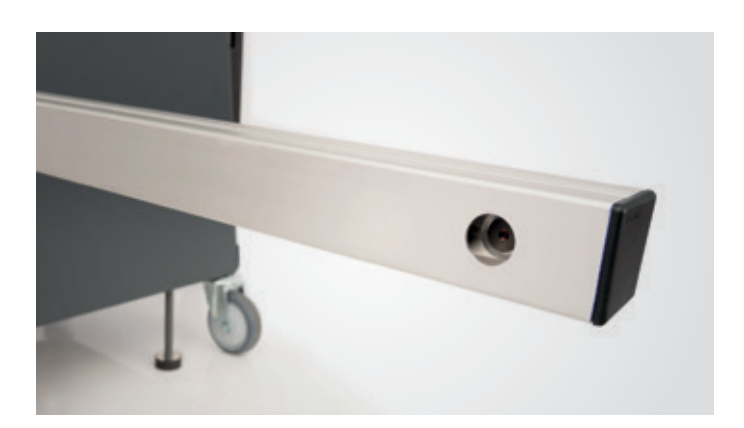
Bosch ADAS Positioning (BAP) Software No tape measures. No plumb bobs. No mirrors. DAS 3000 goes the distance and measures, too – utilizing digital camera recognition innovations for distance measurement and setup.

The superior ADAS workflow can guide you from setup through calibration in half the time.