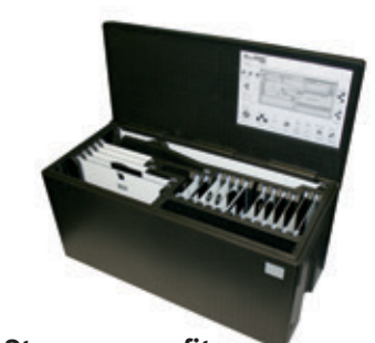
Storage case fits inside the ADAS frame

Integrated storage Convenient storage keeps your equipment contained for immediate access during your first calibration and for all the ones that follow.