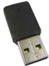
USB WiFi Adapter