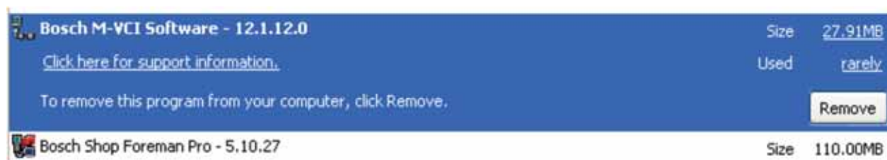
Figure 1 - Bosch Diagnostics Software in Windows Add/Remove Programs

Figure 1 below shows how the applications are displayed in Windows Add/Remove programs. The Bosch M-VCI Software installation (highlighted) along with the Bosch Shop Foreman Pro installation.