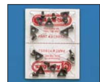
#878051 Carbide Inserts (pkg. of 10) Use 878050 for model 8820