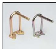
#877040 - 4X4 Drive Yoke Pictured with the standard drive yoke (#878105), the optional deep yoke provides extra depth for use of drive unit on 4x4 hubs.