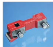
#878115 "Slider Spider" Mounting Adapter