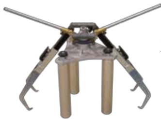
Standard zero run-out truck clamps (set of four) part #932401181

HD tandem axle truck alignment is an essential maintenance step to insure maximum tire mileage, reduction in fuel consumption and to decrease driver fatigue. Vehicle handling is also improved, assisting in safer operating fleets. When aligned properly, rolling resistance is reduced lowering operating cost per mile.