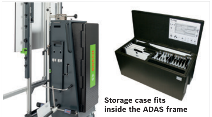
Storage case fits inside the ADAS frame

Optimized target configurations means less time fumbling through the setup – and less time means more money in your pocket.