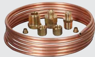
FST 7584 Copper Tubing Installation Kit