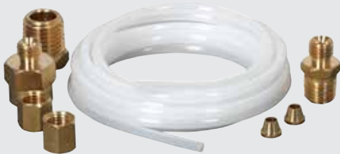
FST 7554 Nylon Tubing Kit