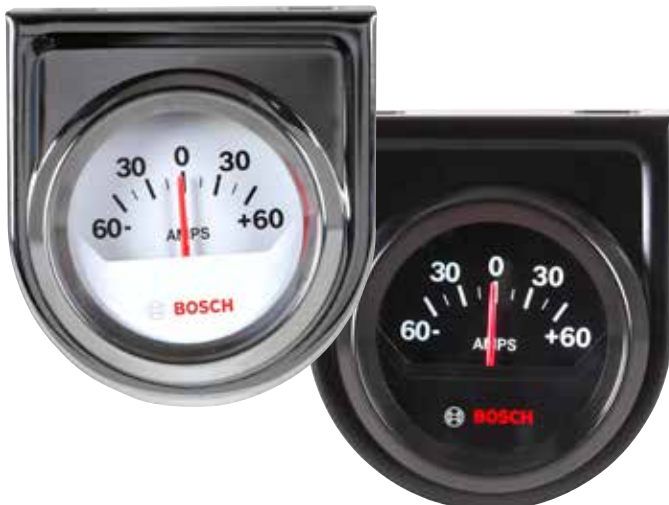
FST 8204 White / FST 8214 Black Style Line 2" Ammeter Gauge