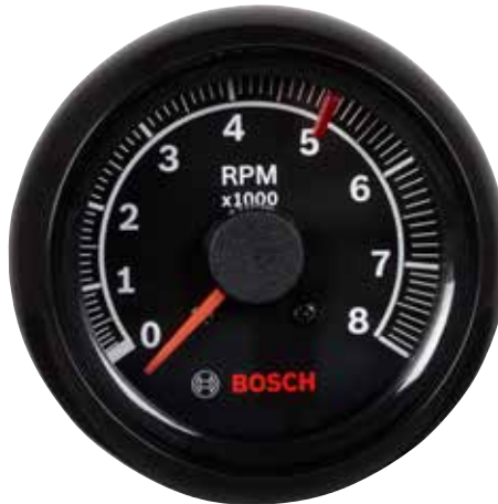
FST 7906 Sport II 2-5/8" Tachometer