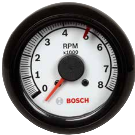
FST 7904 Sport II 2-5/8" Tachometer