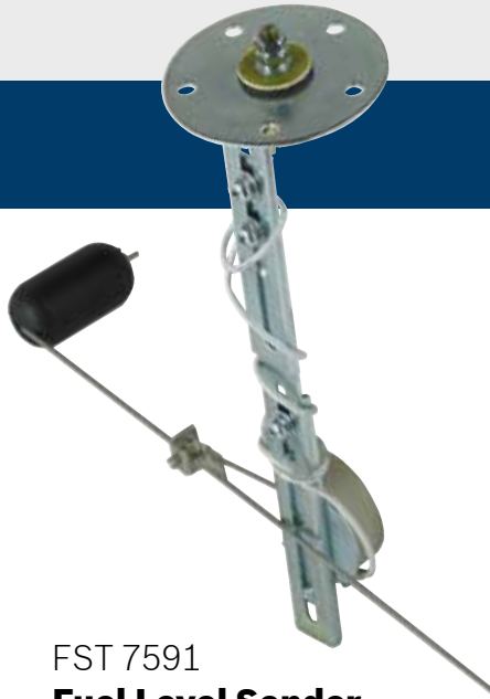
FST 7591 Fuel Level Sender