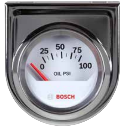
FST 8202 Style Line 2" Electrical Oil Pressure Gauge