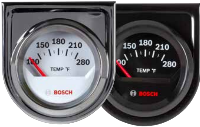
FST 8201 White / FST 8211 Black Style Line 2" Electrical Water/Oil Temperature Gauge