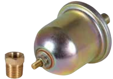
FST 7577 Oil Pressure Sender