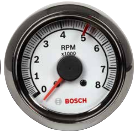
FST 7911 Sport II 2-5/8" Tachometer